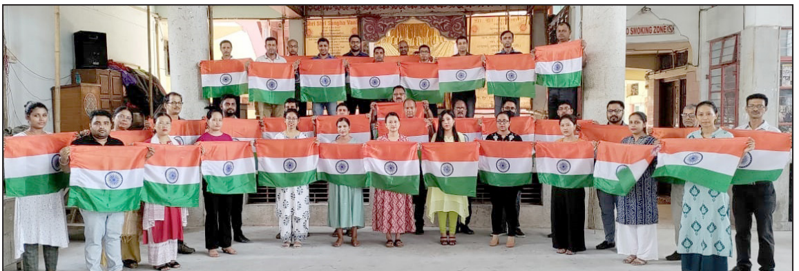
HIGHER SECONDARY TEACHING STAFF