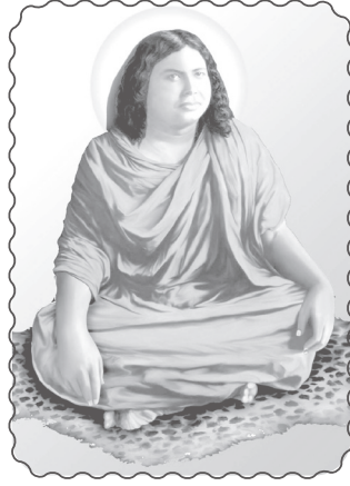
Acharya Srimat Swami Pranabanandaji Maharaj, Founder of Bharat Sevashram Sangha